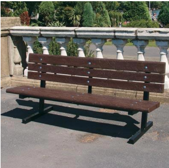
Glasdon Countryside – Zone 2