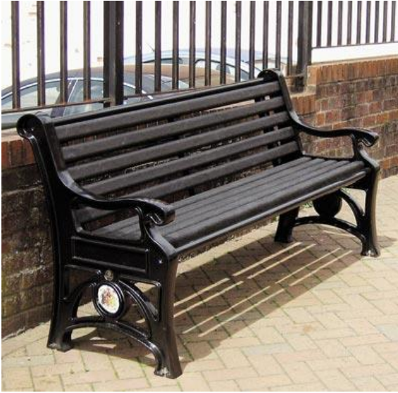
Glasdon Stanford – Zone 1