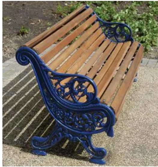
Broxap Rotherham – Zone 1